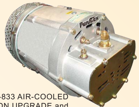
PX-833 AIR-COOLED 50DN UPGRADE and AIR-COOLED CONVERSION KITS