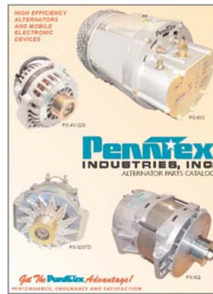
Open the Alternator Parts Catalog