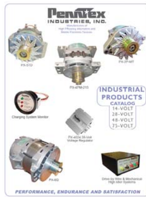
Industrial Products Catalog