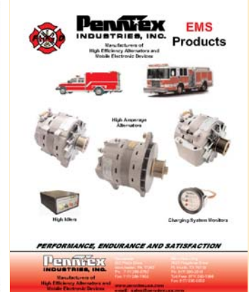
Open the EMS Catalog

Get The PennTex Advantage! PERFORMANCE, ENDURANCE AND SATISFACTION