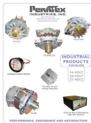
Open the Industrial Products Catalog