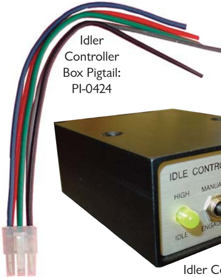
Idle Controller Box Pigtail: PI-0424