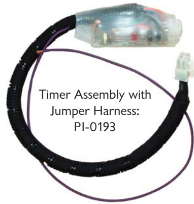
Timer Assembly with Jumper Harness: PI-0193