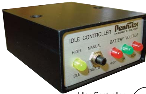
Idle Controller Box: PI-0101