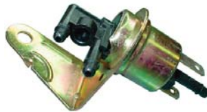
Vacuum Valve: PI-0440

On this page are popular replacement parts from our Idler kits for throttle cable applications. These parts can be ordered from our Distributors.