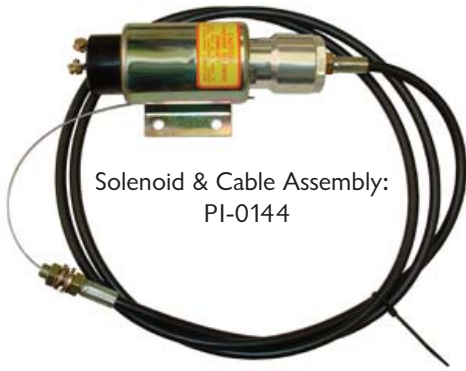
Solenoid & Cable Assembly: PI-0144