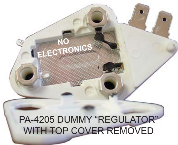
PA-4205 DUMMY “REGULATOR” WITH TOP COVER REMOVED

The PA-4205 serves as connection point for the 2-wire alternator plug. There are no electronics in it and it doesn’t regulate current in any way. If one of the two connections inside goes open, it must be replaced with another “dummy” regulator for the charging system to operate properly.