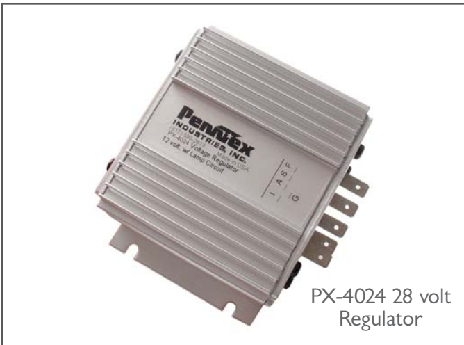
PX-4024 28 volt Regulator