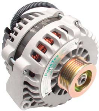
PX-4V-220 CLICK HERE (part of a PX-422V kit)

To see a part-by-part comparison of PennTex and American Armature© alternators: